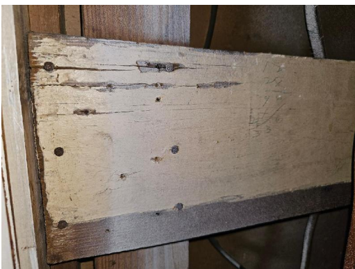
Hallway(005) A-Wall, Left Wood Closet Shelf Support Lead-Positive, Deteriorated